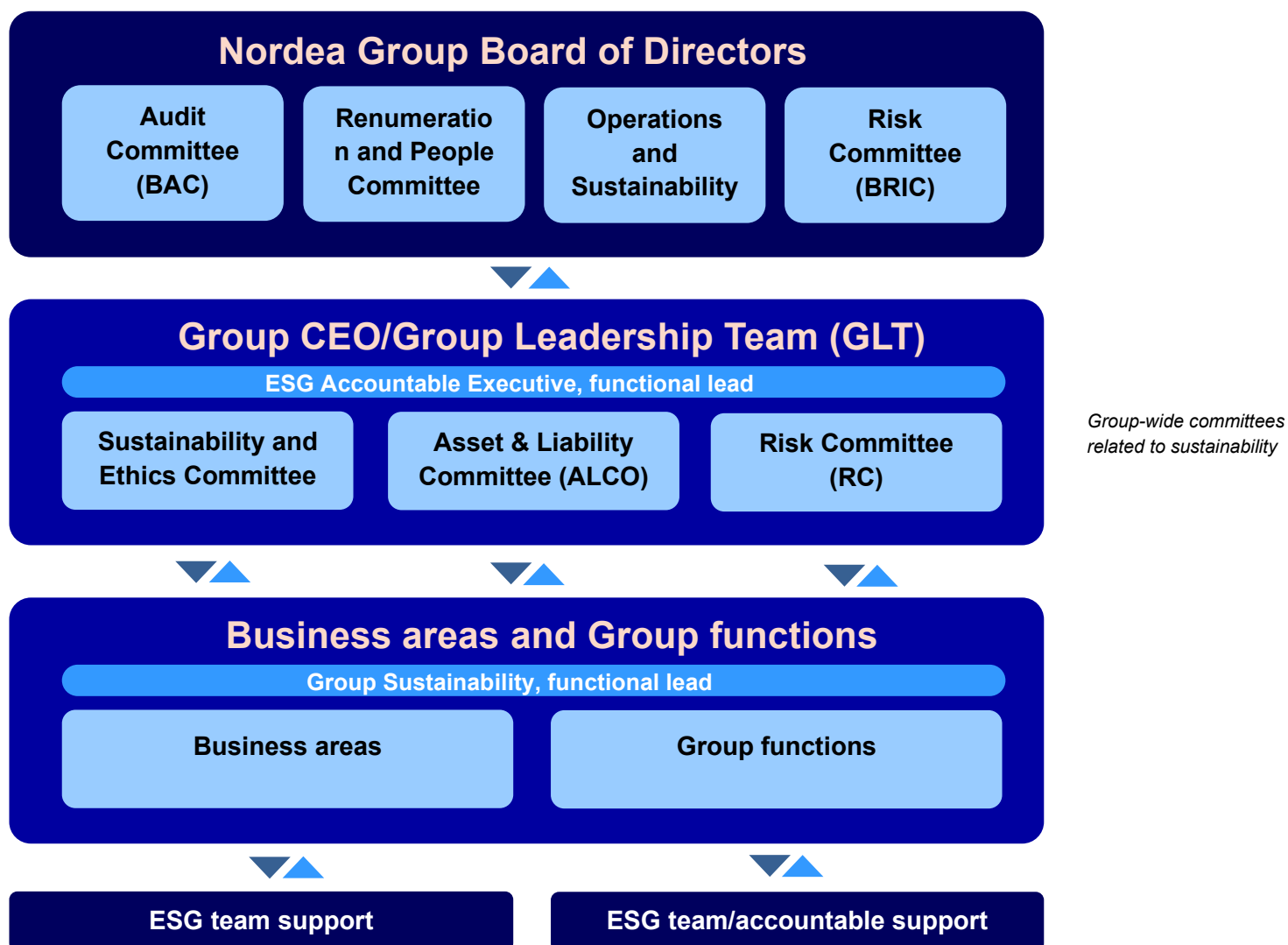
Illustration: Our sustainability governance structure.