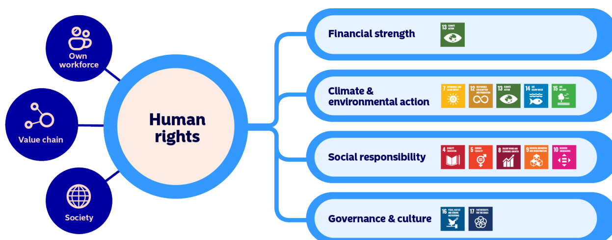
Illustration: The strategic pillars under our sustainability strategy are integrated into all aspects of our business operations.

We believe that managing human rights impacts and avoiding adverse human rights impacts is not only the right thing to do, but also a smart thing to do, as such impacts may, over time, become risks to the business.